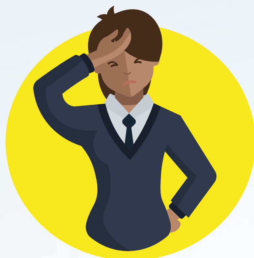
Stress, depression and anxiety